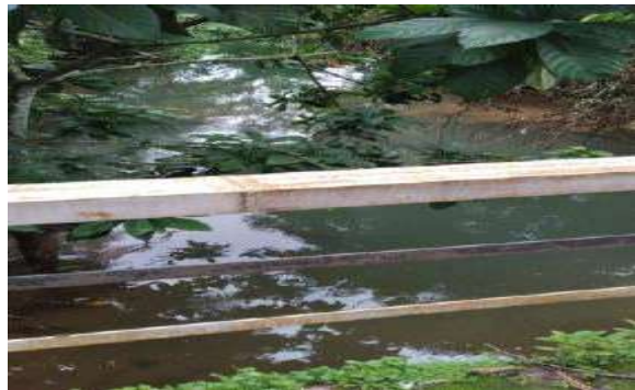
From D/S Side