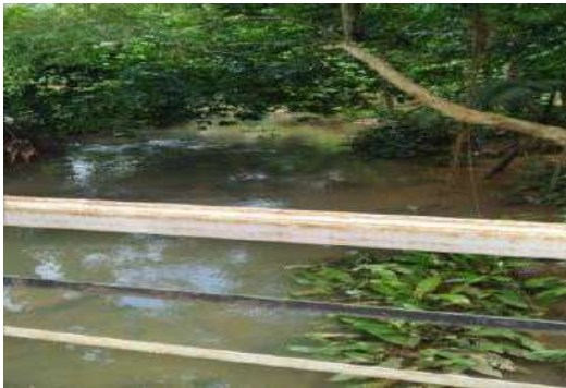
From U/S Side