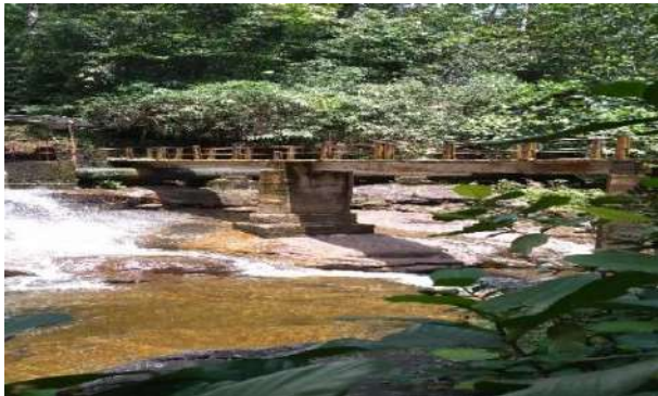
From U/S Side