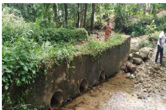
From U/S Side