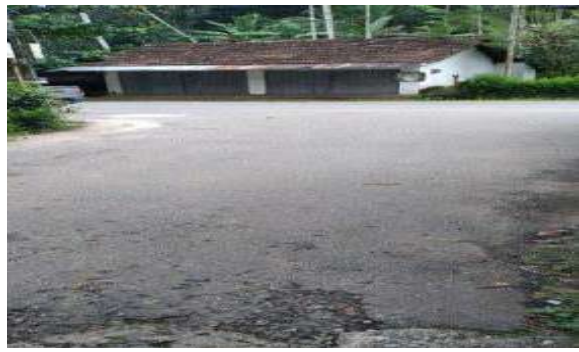
From RB Side