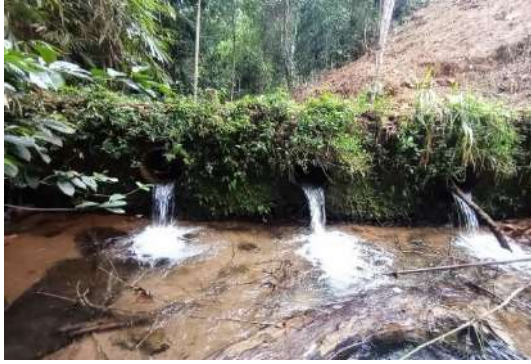
From LB Side