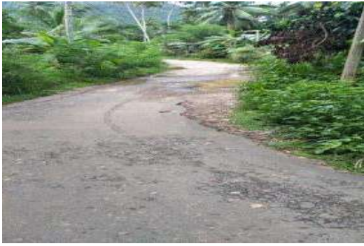
From LB Side