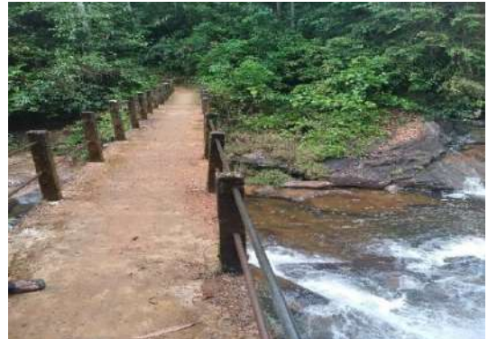
From RB Side