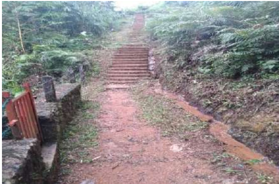
From LB Side