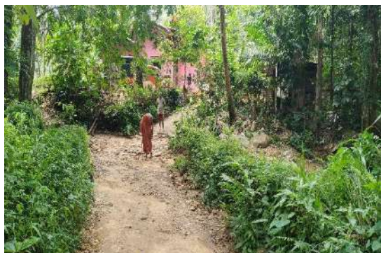
From LB Side