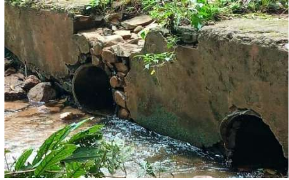
From RB Side