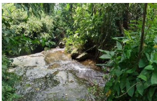
From D/S Side