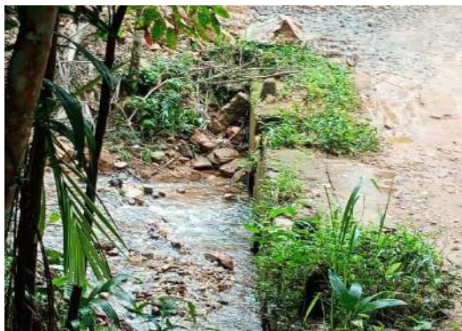
From U/S Side