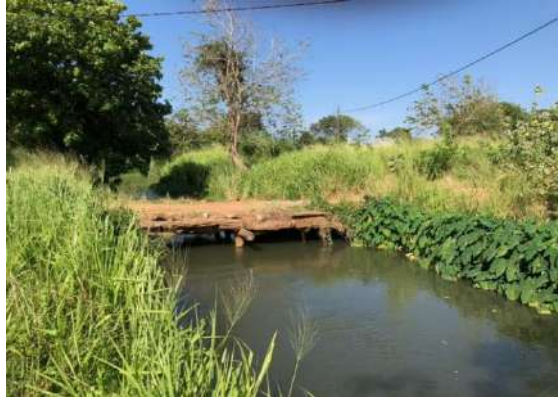
From LB Side