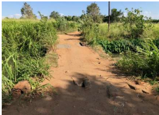
From U/S Side