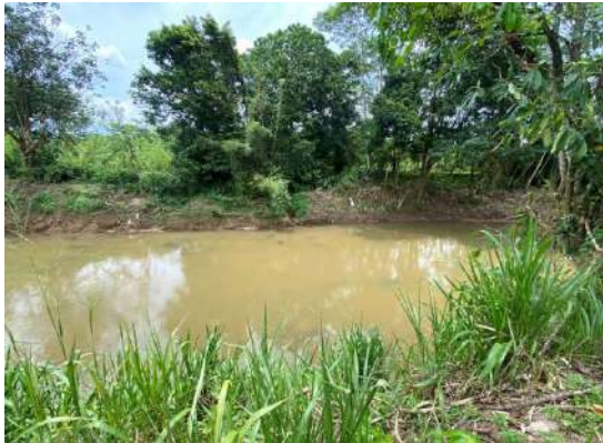
From LB Side

Pelawatta - Hathlahabada - Gorakaduwa Bridge