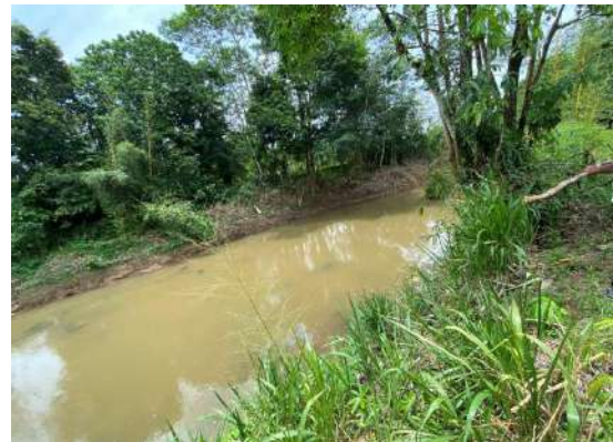
From D/S Side