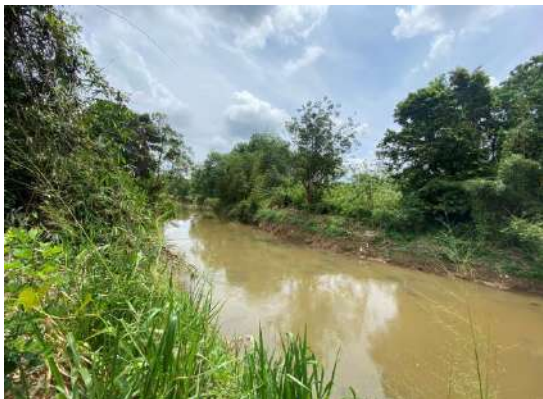
From U/S Side