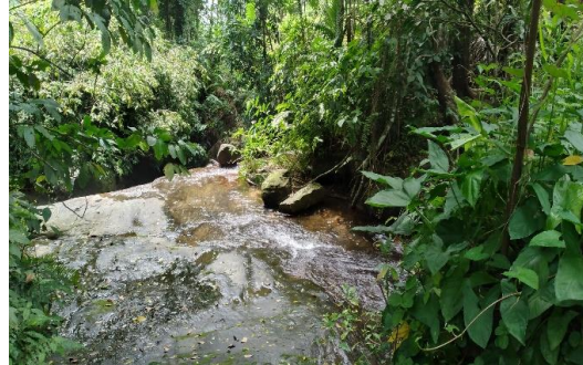
From D/S Side

District – Kegalle DS Division – Deraniyagala