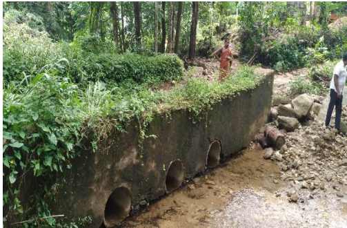
From U/S Side