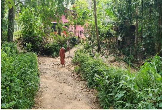
From LB Side