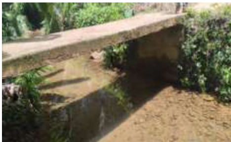
From U/S Side