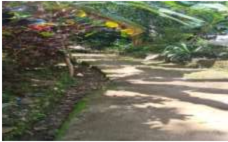
From LB Side