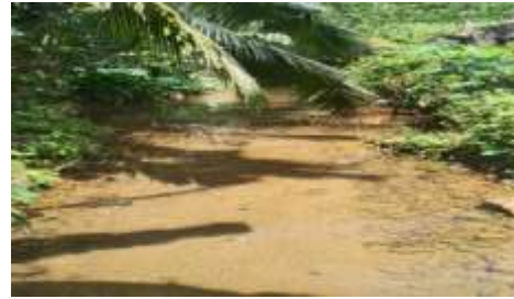
From RB Side