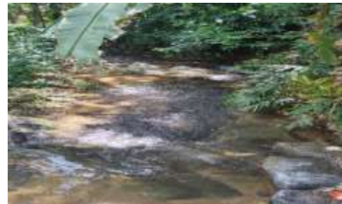
From D/S Side