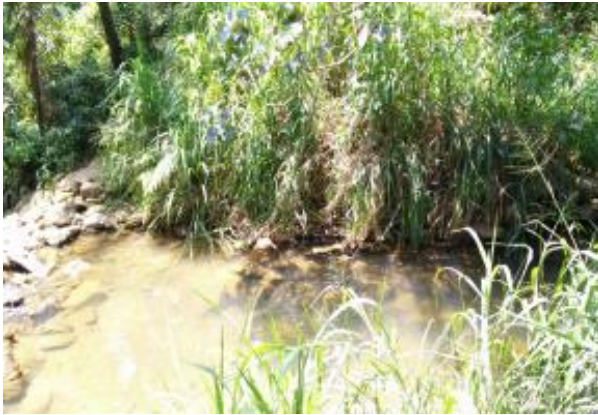
From LB Side