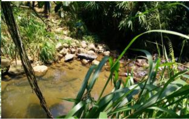
From RB Side