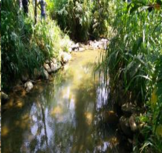
From D/S Side