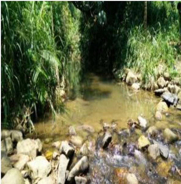
From U/S Side