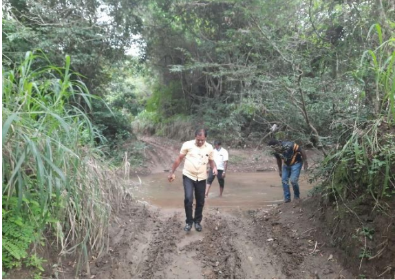
From RB Side RB - Godaulpatha