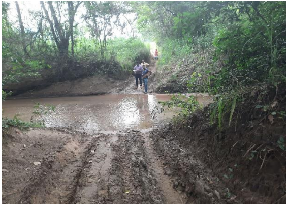
From LB Side LB- Himbiliyakada