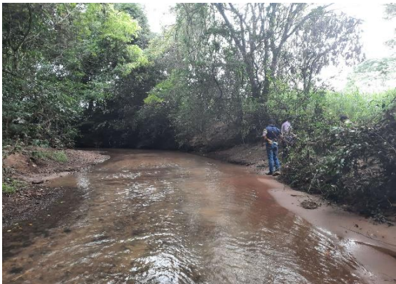
From U/S Side