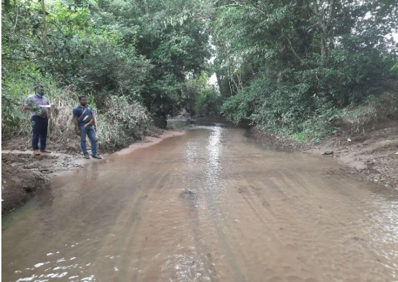
From D/S Side