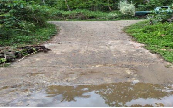
From LB Side LB- Dikellakanda