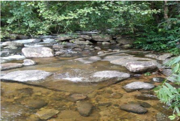
From U/S Side