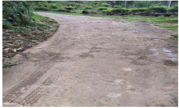
From RB Side RB - Dikellakanda