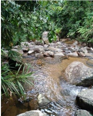
From D/S Side