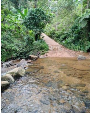
From LB Side LB- Gedarawaththa