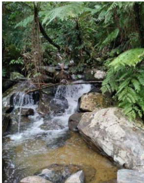
From U/S Side