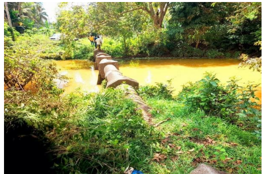
Bridge in Kottukachchiya - Kachchimaduwa Road