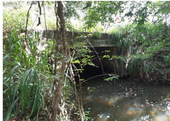
Bridge across Warawewa Spill Canal on Mahagalkaduwala – Galawewa Road